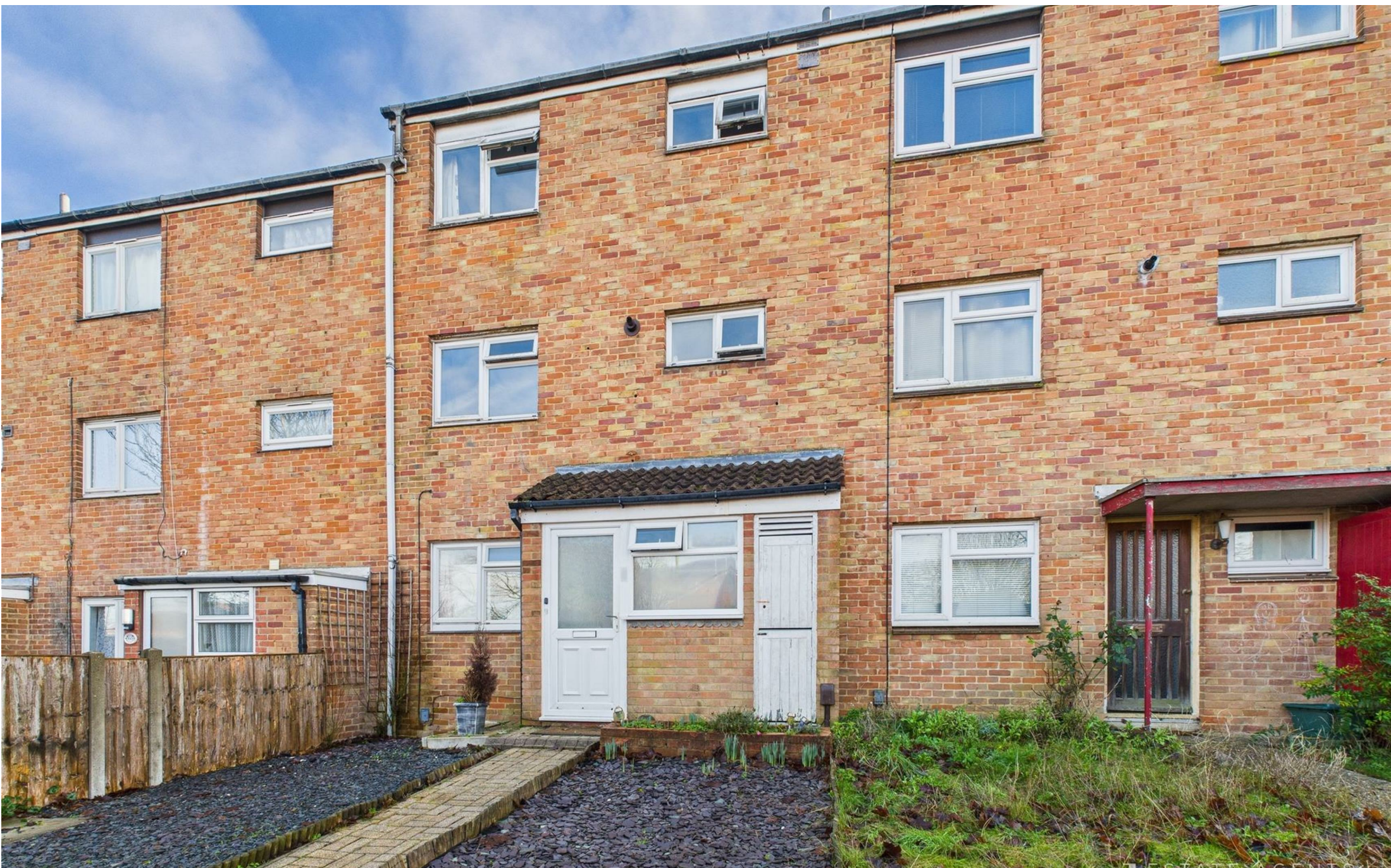
Lehar Close, Basingstoke, RG22 4HT